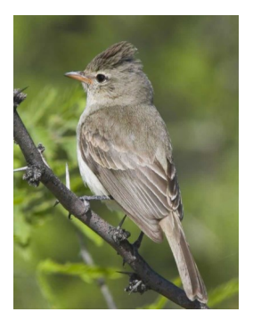
Northern Beardless Tyrannulet

[Jennifer had more to say but we're out of room! Find her at the meeting and she can tell you the rest of the story — ed]