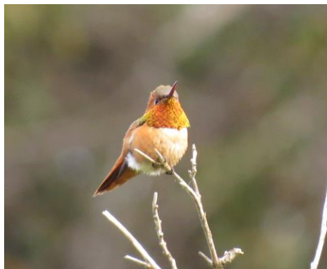
Selasphorus (m) Sycamore Canyon